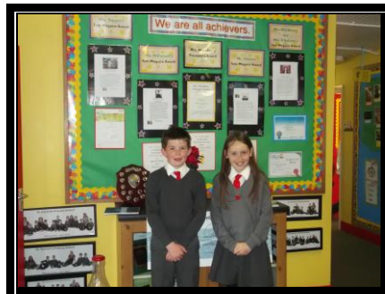
Head Boy and Head Girl (2014-2015)

The school has recently reviewed its policy for Promoting Positive Behaviour in which each child is encouraged, acknowledged and rewarded. Copies of the revised policy will be issued to all parents in the autumn term.